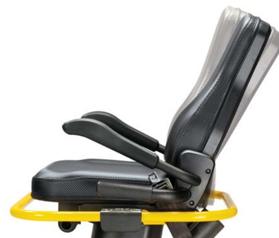
12-degree seatback recline offers maximum comfort