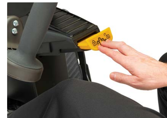
StrideLock® feature locks handles and pedals