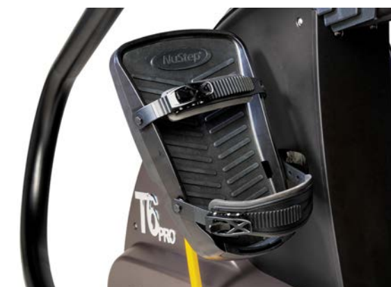
Adjustable foot straps to fit every user