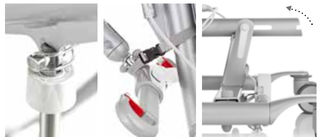
Using a quick-connecting locking pin, the actuator is released from the lift arm.

The lift can be used in a wide range of situations, and, when needed elsewhere, it is easy to move between different users, rooms and homes. The lift is delivered folded.