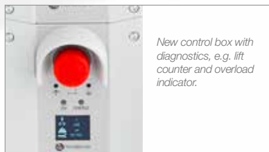
New control box with diagnostics, e.g. lift counter and overload indicator.