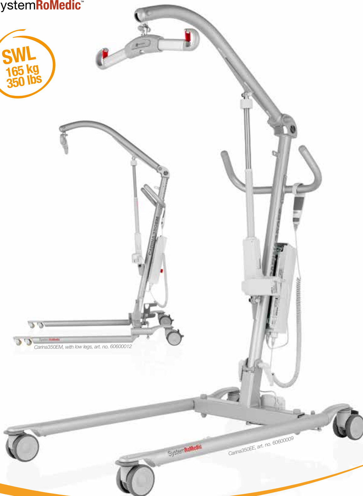
Carina350EE, art. no. 60600009