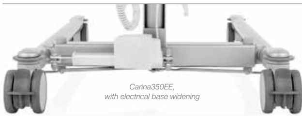
Carina350EE, with electrical base widening