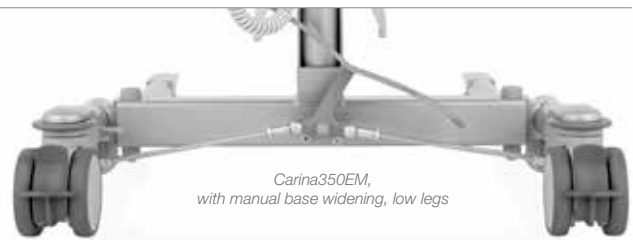
Carina350EM, with manual base widening, low legs