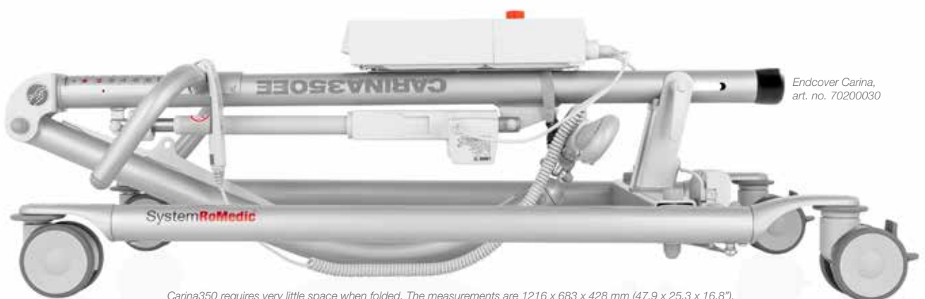
Endcover Carina, art. no. 70200030