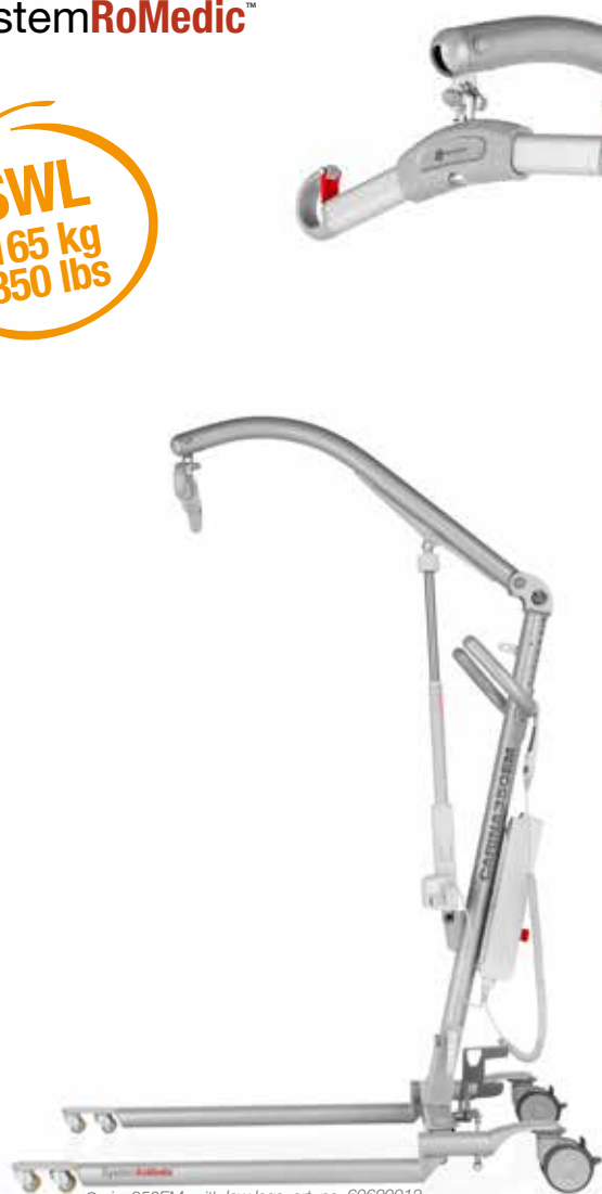
Carina350EM, with low legs, art. no. 60600012