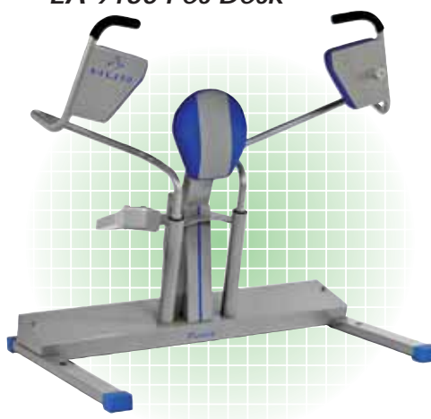
Standard: Large Mushroom Buttons, Handgrips for Additional Support