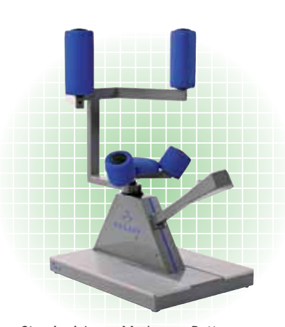
Standard: Large Mushroom Buttons, Lockable Lever Arm, Reversible Rollers