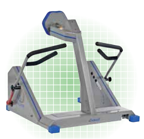
Standard: Large Mushroom Buttons, Multigrip Handles, Lock Mechanism, Adjustable Chest Support, Release Function