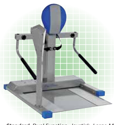
Standard: Dual Function -Joystick, Large Mush-room Buttons, Range Limiters, Horizontally Adjustable Lever Arms, Safety Belt, Base Plate