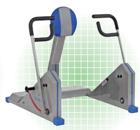
Standard: Large Mushroom Buttons, Multigrip Handles, Lock Mechanism