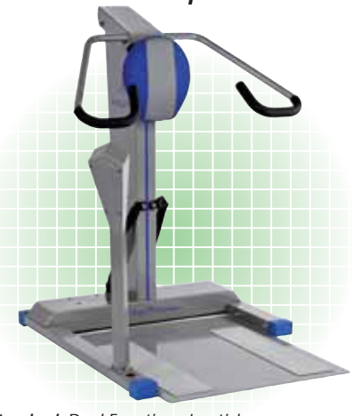
Standard: Dual Function -Joystick, Large Mushroom Buttons, Range Limiters, Safety Belt, Base Plate