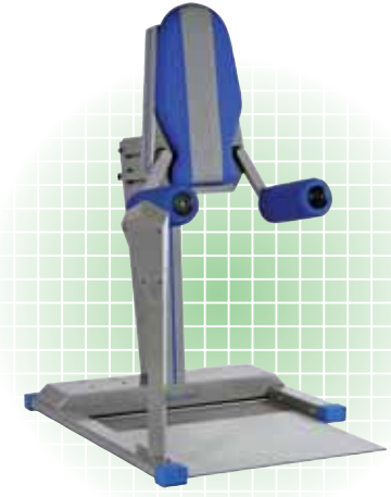
Standard: Dual Function - Joystick, Large Mushroom Buttons, Electrically Adjustable Back Support, Base Plate