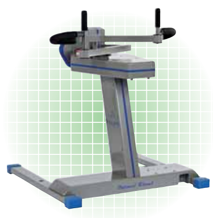
Standard: Large Mushroom Buttons, Multigrip Handles, Adjustable Chest Support,