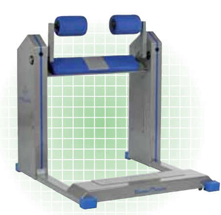
Standard: Dual Function -Joystick, Large Mushroom Buttons